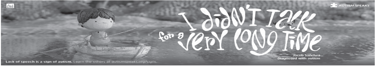
Lack of speech is a sign of autism. Learn the others at autismspeaks.org/signs .